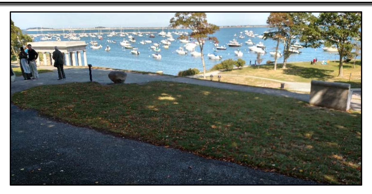
Plymouth Rock (1921 Monument Enclosure at left) at Plymouth Harbor