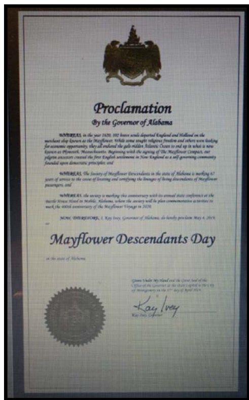
Governor Kay Ivey's Proclamation to the State Society *****