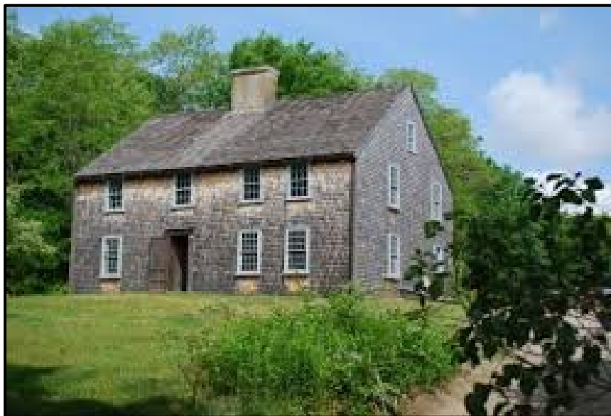
The Alden House in Duxbury MA

at The American Village in Montevallo, Alabama 3727 Highway 119, Montevallo, AL 35115 Phone: 205- 665-3535