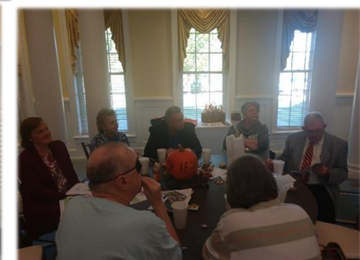
COMPACT DAY LUNCHEON AT THE AMERICAN VILLAGE – MONTCELLO AL