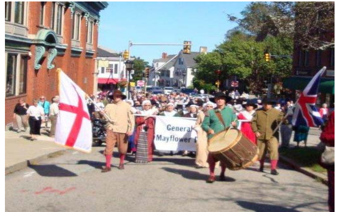
Parade Up the Hill

knowing the great numbers of people who had perished were read out. We then marched up to First Parish Church for the opening ceremony.