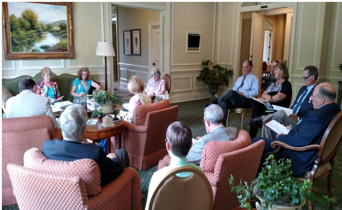
SMDAL Board of Assistants meeting in Montgomery prior to SMDAL Annual Meeting. April 29, 2017