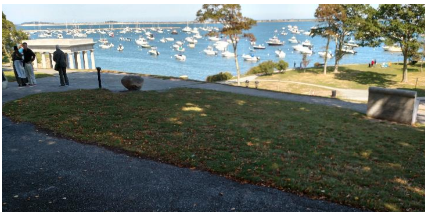
Plymouth Rock (1921 Monument Enclosure at left) in Plymouth Harbor